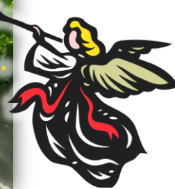
Photo taken July 24th